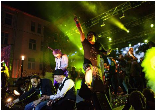
Figure 1. Air Guitar World Championships have been held in Oulu since 1996 ( www.airguitarworldchampionships.com/ ).

As a proof of global level performance in innovation the City of Oulu has got several acknowledgements for being innovative and smart city. Oulu made it just recently onto a Fortune magazine list of the seven best new global cities for startups 1 . In 2012 Oulu was awarded for being the most intelligent community in Europe, and was ranked among the Top7 globally 2 . The tv channel CNBC ranked Oulu as one of the »15 Surprising Global Technology Cities« 3 . The Oulu's international attention is not just recent; for example, the Wired Magazine ranked Oulu already in 90's as the "Silicon Valley of Finland". This success has brought Oulu a notable international media exposure, publishing also prominent articles on the Oulu-based start-ups.