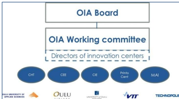
Figure 2. Oulu Innovation Alliance structure.

The agreed initial focus areas were– based on a study to find the most potential sectors from the international perspective - Internet research, printed electronics, international business, environment and healthcare sectors. The activities focused on the creation of centers of excellence and on an open ubiquitous city in Oulu. The OIA has established several innovation centers that are responsible for executing the OIA strategy in their respective fields: Martti Ahtisaari Institute of Global Business and Economics (MAI, http://www.maigbe.fi ), Center for Internet Excellence (CIE, http://www.cie.fi ), PrintoCent ( http://www.printocent.net ), Center for Health and Technology (CHT, http://www oulu.fi/english/CHT ) and Center for Environment and Energy (CEE).