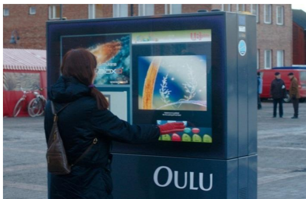
Figure 4. UBI-screens, which are part of OULLabs infrastructure, are large, public, interactive displays installed in several locations in downtown Oulu.

The panOULU 17 wifi network, established in 2003, is an excellent example of the Oulu approach to the Living Lab activities. Developed in collaboration the network works as a testing environment, but also provides an open and free Internet access to all. Today, the panOULU is a regional municipal WiFi network comprising 1300 access points around the City of Oulu and 8 nearby townships. The City of Oulu provides the largest zone of 580 access points covering the downtown of Oulu and all municipal facilities. The 1300 access points provide an open (no authentication or registration) and free (no payment) Internet access to the general public. The network is used monthly by over 40'000 unique devices, of which a large proportion belongs to visitors. The network is also a valuable asset for numerous R&D projects. The usage of the network has grown so much that the City of Oulu and the University of Oulu have just decided to sponsor the tripling of the capacity of the Internet gateway of the network.