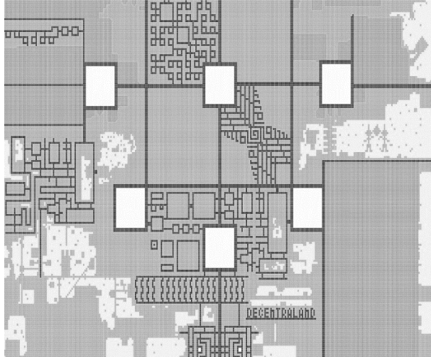
Figure 1: DCL hexagon grids during the Terraform event

the DCL content and implementing a scripting system for the peer-to-peer communication was started. A full-fledge metaverse with the customizable laws of physics and other assets that will allow users the complete freedom will be named the Silicon Age [13].