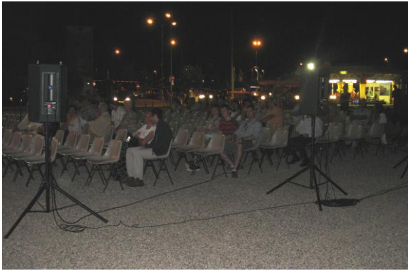
Fig. 2. Garda 2010 open air opera concert: audience loudspeaker coverage

and real time judgement, easy cable adjustment, free mixer position reaching and last but not least, italian safety law requirements' meeting. First part (stage to mixing position) was 20 rows and second part (from mixing position to rear rank) was 11 rows, for a total of more than 900 possible listening positions (about 6x4 seating positions were occupied by mixing position). Resulting audience had at least 5 meters promenade on both sides as shown in Figure 2.