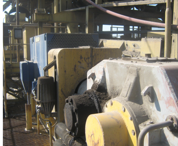
Figure 3. Motor, coupling and reductor at the drive station

Based on Eqs. 1 - 10, a computer program was developed in the software package Matlab enabling selection of the optimal nominal parameters for subsynchronous-cascade elements. The program input data include the number of the drive motors and nominal parameters, wanted speed-control range and transformer secondary voltage.